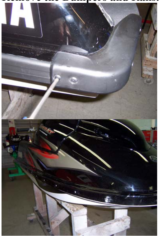
Remove the Bumpers and Rails.