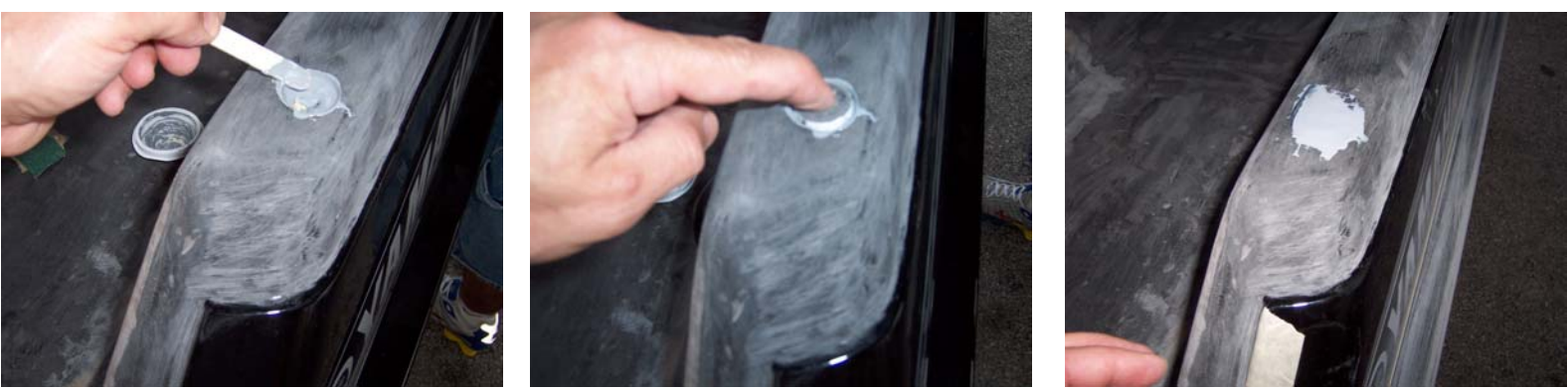
Than use Epoxy glue to stick that piece.