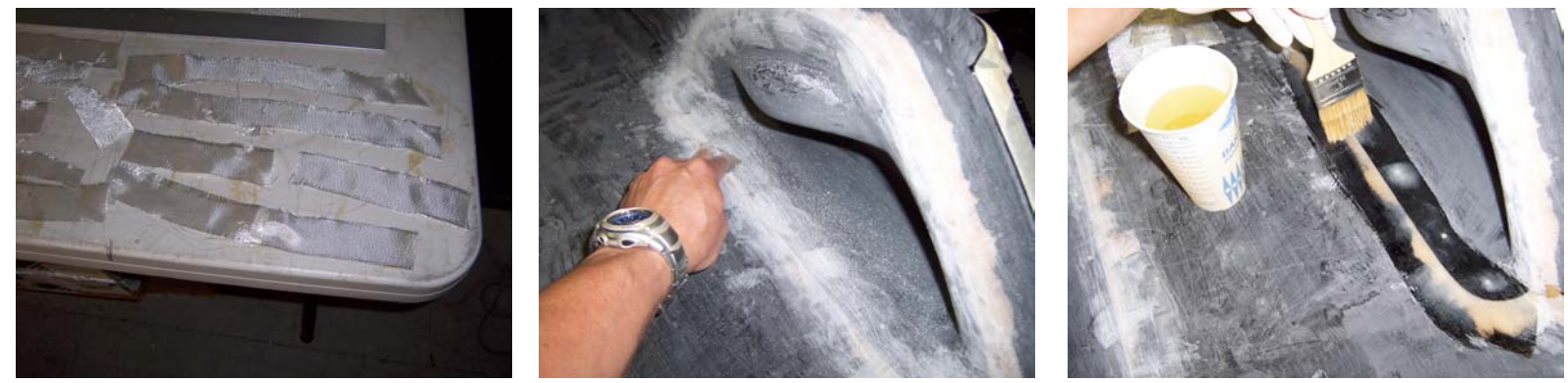
Cut some strips of fiberglass and put on the ski, make sure you have enough strips before you add resin.