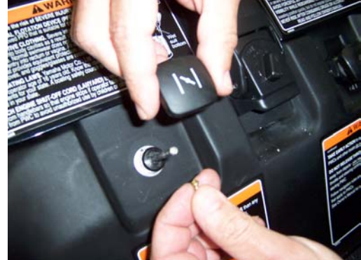
Remove Dash Panel.