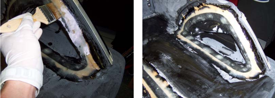
Using a paintbrush, apply the fiberglass with resin around the edges of the foothold and wait until dry.

Than, using sandpaper# 80, remove the excess of resin, until you get a smooth and sharp surface.